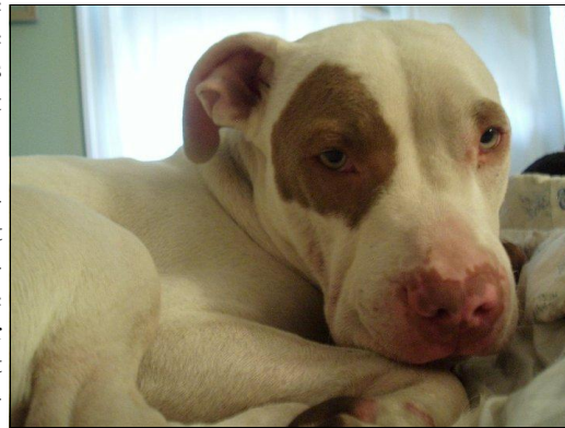
Elliot, a deaf American Bulldog, found his forever home on Aug. 14 2010

more in our wonderful foster homes as I type so we have made and exceeded our original goal. We couldn't be more proud of the steps we've made to help America become a "no-kill" nation but there is always more to do.